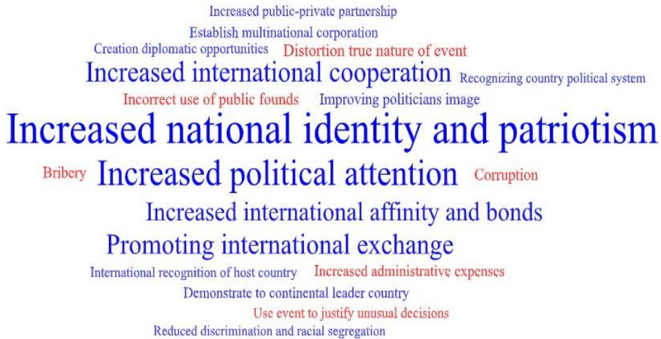
Figure 4. Political impacts of sports mega-events.

been respectively weighed three and two times the green technology and waste increase, it can be concluded that the main concern for the host community is traffic congestion and pollution increase. In general, the results of our systematic review show that the negative environmental impacts mentioned in the articles of recent decades have been very significant compared to the positive effects.