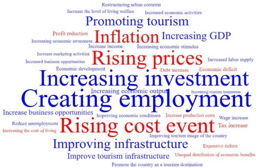
Figure 1. Economic impacts of sports mega-events.