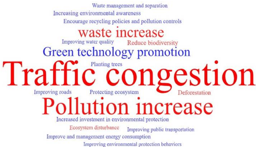
Figure 5. Environmental impacts of sports mega-events.