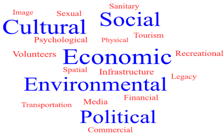
Figure 6. Impacts of sports mega-events at a glance.

On the other hand, some negative and positive effects are inevitably caused by these events that researchers should seriously focus on. Some positive effects perceived as seemingly significant but received less attention are volunteer-related, spatial, recreational, and leisure-related positive ones. Also, some adverse effects have been neglected, such as sexual, mental, financial, transportation, and infrastructure-driven. These mentioned above, positive and negative effects have been identified as the literature gaps.