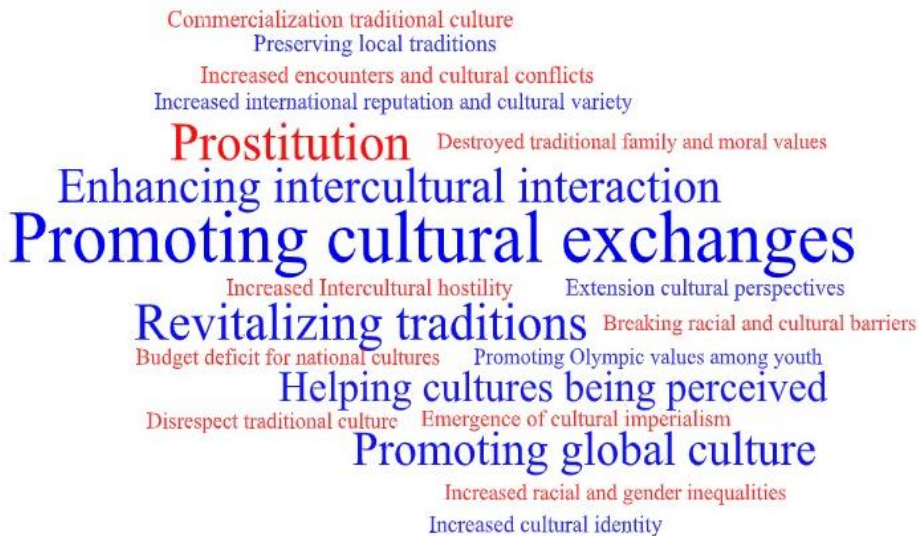
Figure 3. Cultural impacts of sports mega-events.

cultures being perceived, and promoting global culture, can be highly prioritized. Cultural effects, such as economic and social ones, can reflect a negative aspect. In other words, they will have some adverse effects, such as increased racial and gender inequalities, by which women's social security may be endangered in some way. Therefore, the host communities will be inevitably involved with their future irreparable consequences unmentioned or clarified in the literature.