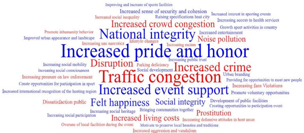
Figure 2. Social impacts of sports mega-events.